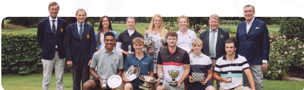
Winners of the 2025 edition